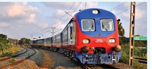
Handover of Final Location Survey report for Raxaul-Kathmandu Rail line