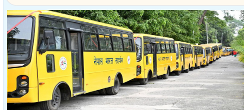
234 School Buses Gifted