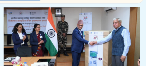
200 Kidney Dialysis Machines Gifted