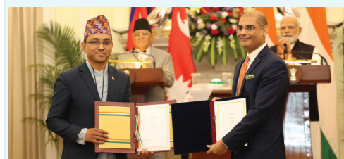
MoU signed on Cross-border digital payments Between NPCI (India) and NCHL (Nepal)