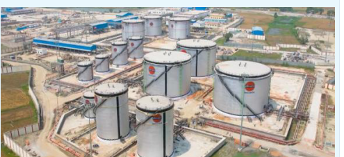
Ground Breaking of Phase II of Motihari-Amlekhgunj Oil Pipeline