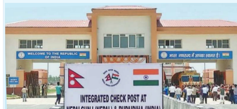
Inauguration of Integrated Check Post, Nepalgunj