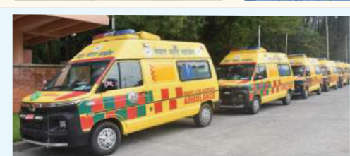
974 Ambulances Gifted