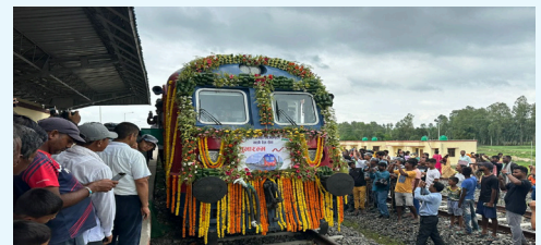
Handover of Kurtha-Bijalpura section of Jayanagar-Bardibas Rail Link