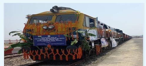
Freight Rail operations between Bathnaha (India) and Nepal Custom Yard Biratnagar (Nepal)