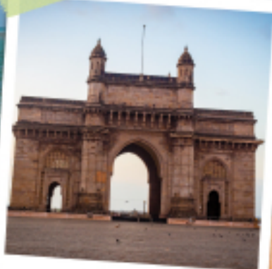
Gateway Of India