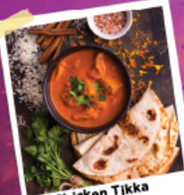
Chicken Tikka with Naan

From the explosion of flavours that suit every palate to the rich heritage and vibrant cultural & religious festivals.