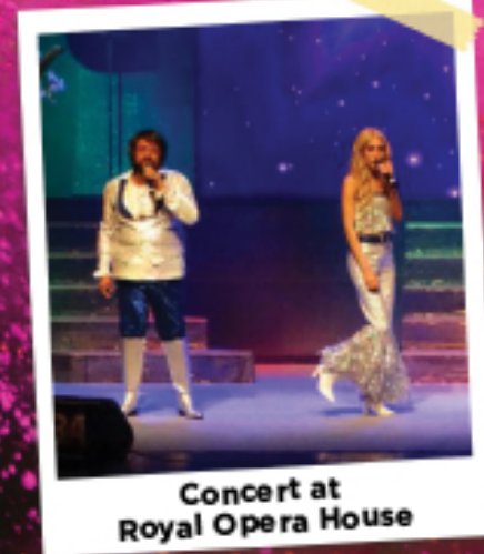
Concert at Royal Opera House

INDIA IS BURSTING WITH UNFORGETTABLE AND VIVID EXPERIENCES.