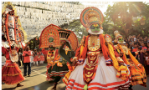
Vibrant variety of cultures and languages