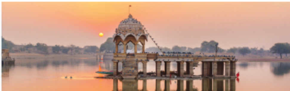
Breathtaking natural beauty and places to explore