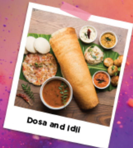
Dosa and Idli