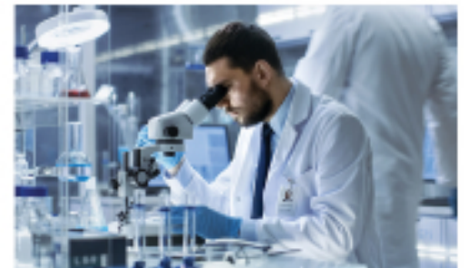
A flourishing innovation and creative hub