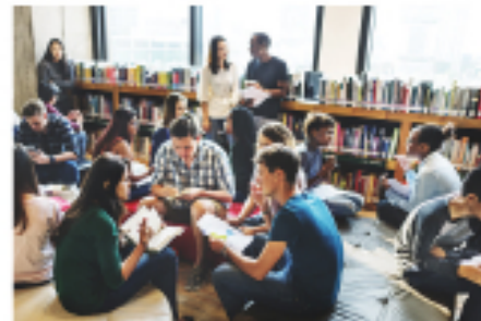
Second largest Higher Education System