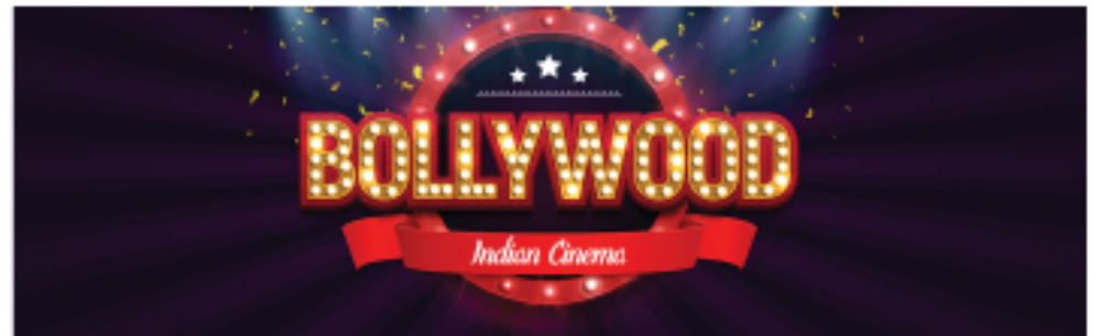
Home to the famed Bollywood industry