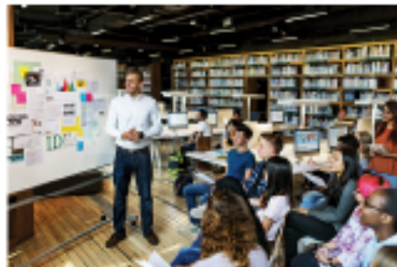
Second largest English-speaking country