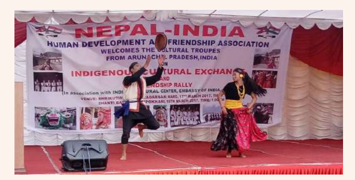
Students of Indian Cultural Centre performing traditional Nepali dance