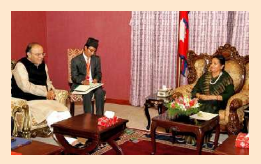
Visit of Minister of Finance Shri Arun Jaitley to Kathmandu 2-3 March, 2017