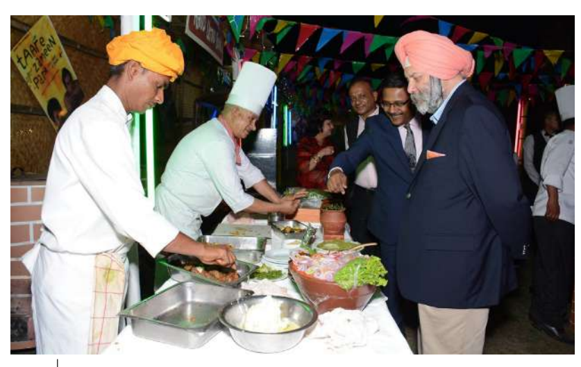
The event was inaugurated by H.E. Shri Manjeev Singh Puri, Ambassador of India to Nepal.

The ICC, in association with Hotel Soaltee Crown Plaza and Nepal SBI Bank, together organised a food festival titled Dhaba - a festival of Punjab. The event was inaugurated by H.E. Shri Manjeev Singh Puri, Ambassador of India to Nepal. The food festival witnessed food stalls serving popular mouth-watering Punjabi delicacies.