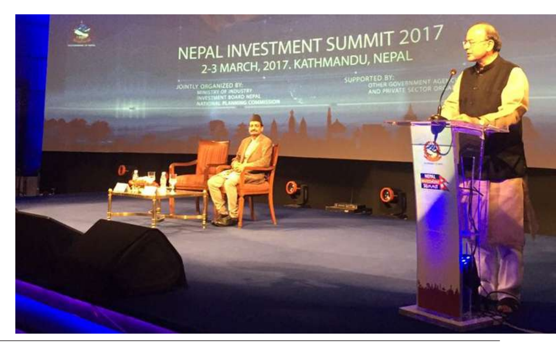
WWW.INDIANEMBASSY.ORG.NP APRIL/MAY-2017 [7]

The Hon'ble Finance Minister's visit highlighted the importance that India attaches to its relations with Nepal. The meetings were held in a warm and friendly atmosphere, which traditionally characterise the relations between India and Nepal.