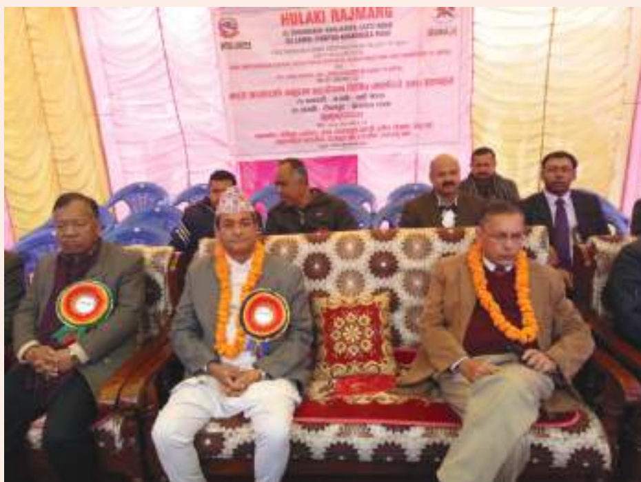
Ambassador's address at the Inauguration Ceremony:

"I firmly believe that the Hulaki Rajmarg Project would be a milestone in improving the cross-border connectivity and trade between India and Nepal."