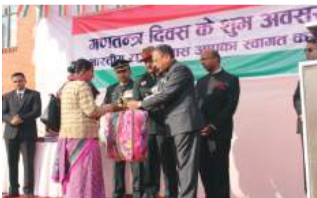
AMBASSADOR FELICITATING A VEER NARI