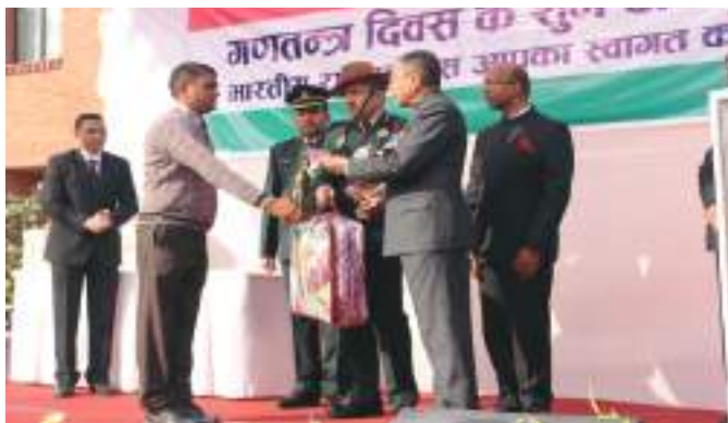
AMBASSADOR FELICITATING A DISABLED EX-SERVICEMAN

14 Veer Naris/Ex-servicemen were felicitated on the occasion of Republic Day 2017 by presenting blankets and AGIF cheques worth Rs 3.75 Crores.