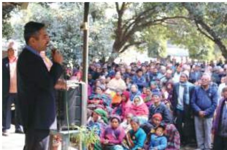
DEFENCE ATTACHE ADDRESSING THE PENSIONERS AT SPPC BHARATPUR

During the months of December 2016 & January 2017, Seasonal Pension Paying Camp (SPPC) was conducted at Bharatpur. Pension was also continuously disbursed through the three PPOs. A total of NRs 803 Crores