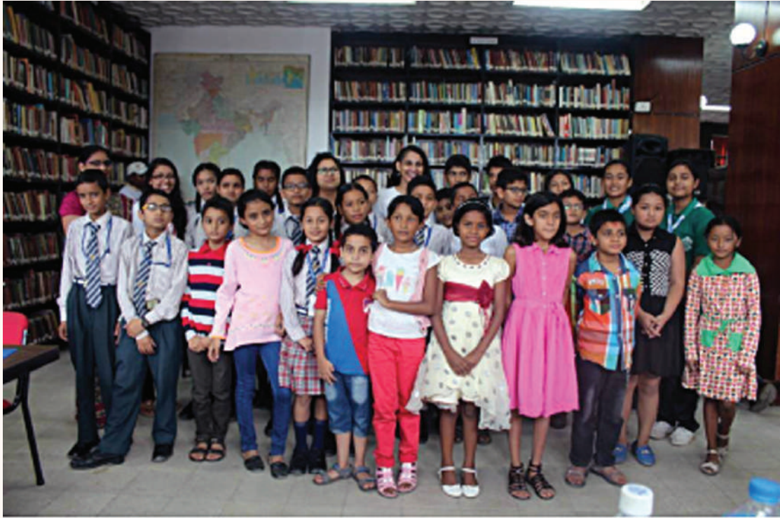
'Kidmandu Programme' , a Poetry Workshop for children was organized by BPKF on 17 th September, 2016 at Nepal-Bharat Library, Kathmandu.